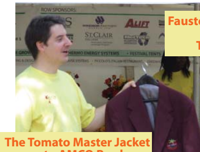
The Tomato Master Jacket goes to AMCO Produce